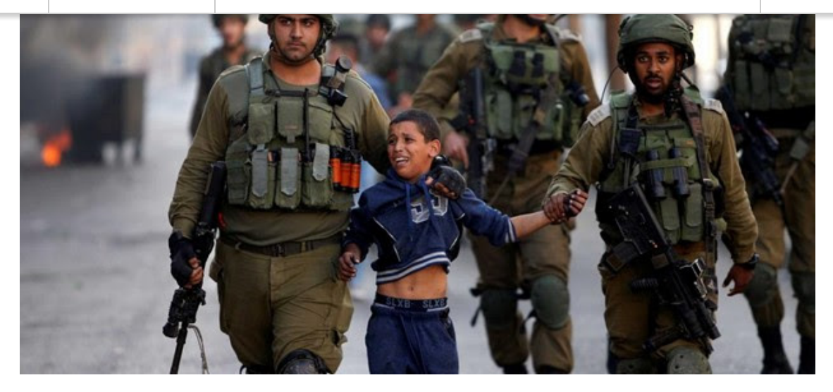
Arrest, detention and interrogation of Palestinian teenagers living in the West Bank.

A special webinar organized by <u>Stand Up for Palestinian Children's Rights</u>, a broad based cross-Canada planning committee, in collaboration with the <u>Ottawa Forum on Israel/Palestine</u> (OFIP).